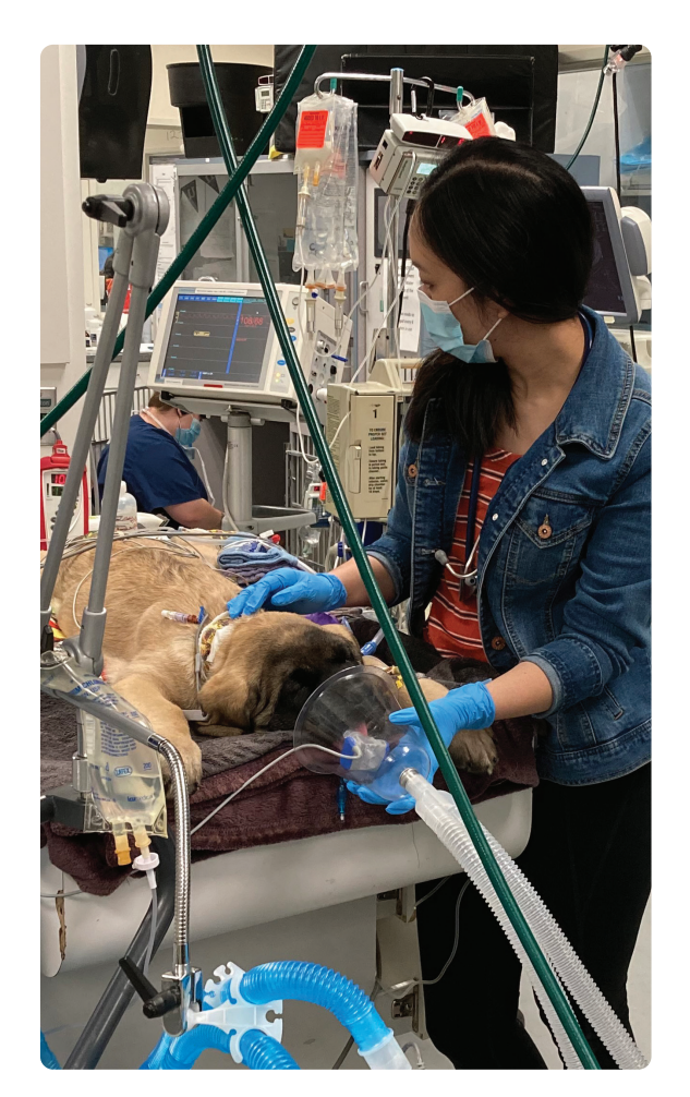
Blue Boy being treated in the ER