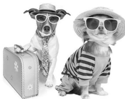
Don't Be Caught Unprepared Before Travel Visit www.aphis.usda.gov/aphis/pet-travel

A well designed plan is the only way to avoid putting a dent in your planned journey.