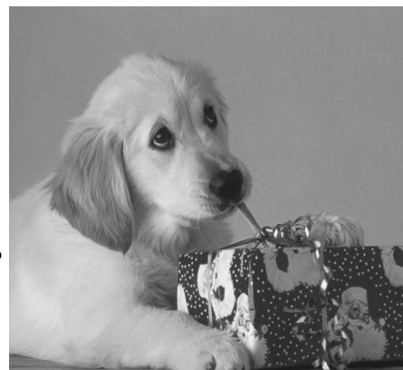
A Present? For me? Please Don't Let Me Swallow the Ribbon!

As you gather with your families to celebrate the holidays, we wish you a blessed holiday season. May your homes always be filled with health, gratitude and joy and Happy New Year from all the staff at VCA McClave Animal Hospital.