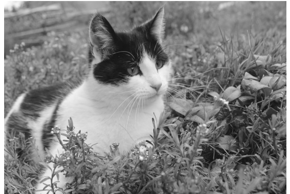
"Came the Spring with all its Splendor. All its Birds and all its Blossoms. All its Flowers and Leaves and Grasses." Henry Wadsworth Longfellow

Spring however should not automatically result in a trip to the veterinarian. Think prevention: hike with your dog on a leash, watch out for rattlesnakes, keep your cats indoors at night, increase your compliance with flea and tick medications, exercise tight mosquito control and do not feed wildlife. You are now set for a nice spring and you could start planning an exciting summer escape!