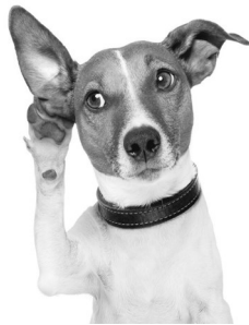
Head Shaking and Ear Scratching Are Common Signs of Otitis.

Unlike cats, mites are a rare cause of ear infections in dogs. Generally, dog ear infections occur secondary to many risk factors such as genetic predisposition, allergies, excessive moisture, wax formation and ear anatomy (narrow ear canals or excessive hair). Moisture gets trapped in the ear and infection follows. Ear infections can also be secondary to foreign bodies such as foxtails.