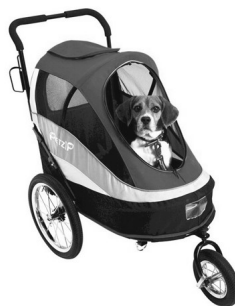
"Who's Momma's Little Boy?"

The interesting part is that this behavior was not as consistent when the type and content of the speeches were mixed up (for instance baby talk but non-dog related content). The researchers concluded that dogs need to hear relevant content as well as a high pitched emotional tone to be attracted. All studies were done with women voices. Gender differences are currently being studied.