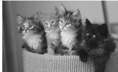
Each Kitten Within the Litter May Have Unique Individual Needs

Their eyes start to change colors after seven weeks when they are gaining coordination. By eight weeks, they have 26 baby teeth and are exploring away from mom. They are able to jump, are approximately two pounds of weight and can be fully weaned.