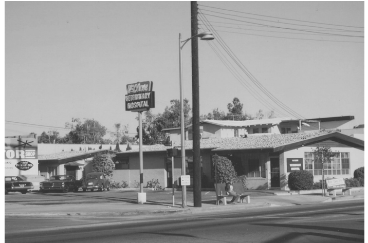
The Original Hospital. 1975 The Main Entrance Was Off Reseda Blvd.